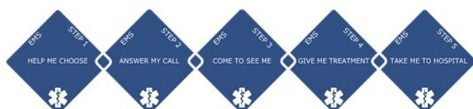
Figure 1 - Five Step Ambulance Care Pathway

WAST provides a range of services which are coordinated through Clinical Contact Centres which, receive calls for help from the public and health care professionals who need to access emergency assistance for a patient.