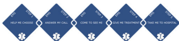
Figure 1 - Five Step Ambulance Care Pathway

WAST provides a range of services which are coordinated through Clinical Contact Centres which, receive calls for help from the public and health care professionals who need to access emergency assistance for a patient.