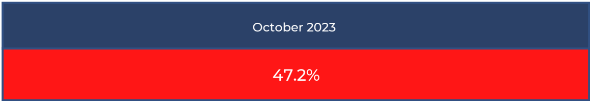
Table 3 – Monthly National RED Percentage Response Target

The Wales national target for a response arriving to RED calls in 8 minutes is 65%. At an all-Wales level, this target was not met for this month.